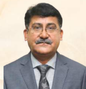
FROM THE OFFICE OF THE PRESIDENT