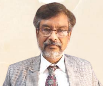
GENERAL SECRETARY & CEO SPEAKS