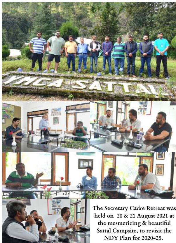
The Secretary Cadre Retreat was held on 20 & 21 August 2021 at the mesmerizing & beautiful Sattal Campsite, to revisit the NDY Plan for 2020-25.