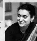
President of All India Congress Committee