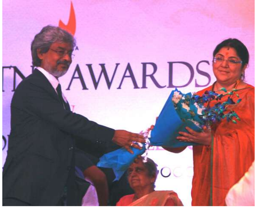
At a Public Function on 22 May 2022 alongside Ms. Locket Chatterjee, Member of Parliament and Indian Actress.