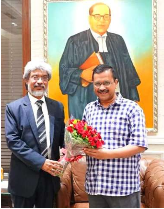
Connects with Honorable Chief Minister, Mr. Arvind Kejriwal on 22 May 2022.