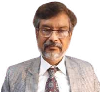
GENERAL SECRETARY & CEO SPEAKS

BUILDING COMMUNITIES | 01 JANUARY 2022 | VOLUME 30