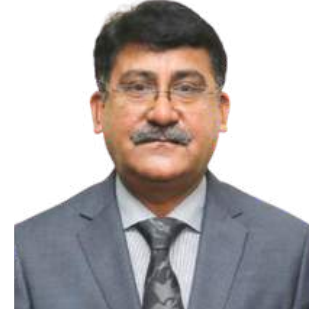
FROM THE OFFICE OF THE PRESIDENT