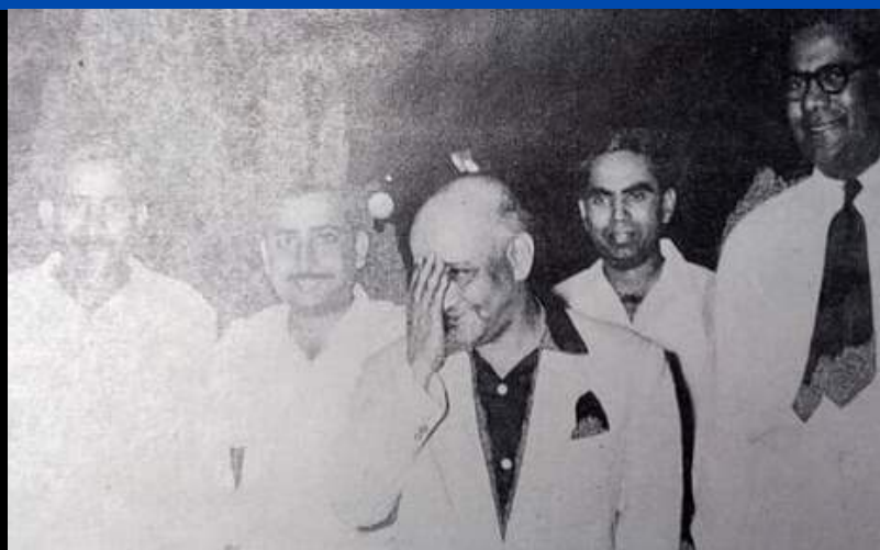
LEGENDARY CINE STAR DAVID GRACED EVERYONE WITH HIS PRESENCE AT THE YMCA CULTURAL EVENING IN JUNE 1961.