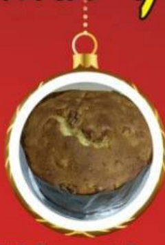
Walnut Cake Rs. 425/- (½ KG)