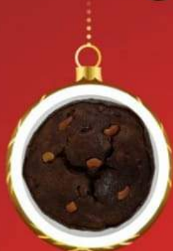
Plum Cake Rs. 395/- (½ KG)