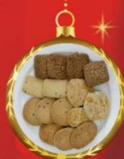
Assorted Cookies Rs. 325/- (Per KG)