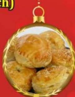
Mutton Patties Rs. 70/- (Each)