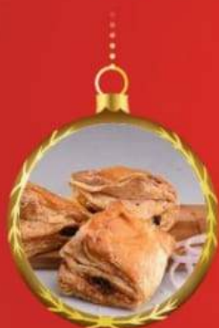
Chicken Patties Rs. 70/- (Each)

INTRODUCING Plum Cake & Dry Fruit Hamper Rs. 850/-