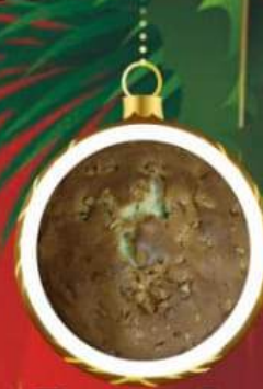
Fruit Cake Rs. 350/- (½ KG)