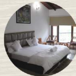
Super Deluxe Room