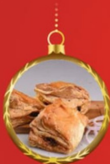
Chicken Patties Rs. 70/- (Each)