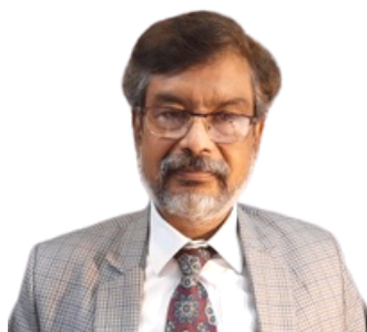
GENERAL SECRETARY & CEO SPEAKS

BUILDING COMMUNITIES | 01 DECEMBER 2021 | VOLUME 28