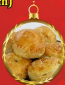
Mutton Patties Rs. 70/- (Each)