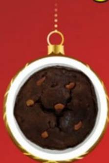
Plum Cake Rs. 395/- (½ KG)