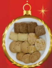
Assorted Cookies Rs. 325/- (Per KG)