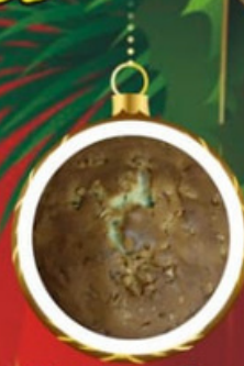
Fruit Cake Rs. 350/- (½ KG)