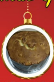
Walnut Cake Rs. 425/- (½ KG)